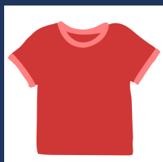
Non-school uniform days

You can help us raise vital funds for our Swansea Bay NHS, while boosting awareness for our local health board charity and getting the school involved in an impactful local community cause. We've got some ideas to get you started: